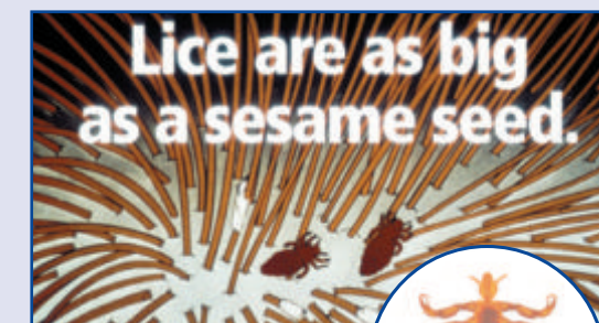
Illustration courtesy of Bayer Corporation